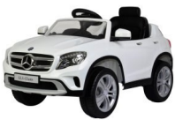
Mercedes GLA 12v $181/$215 / $185

Every kid wants to drive just like mom and dad. Best Ride On Cars provides the benefits of having their own ride on toy that makes them imagine they are driving a real vehicle. Just like the real thing, the Best Ride on Cars are battery powered riding toys that give your child a breathtaking driving experience with a special feature of a parental remote control access. Cars are equipped with working lights, leather upholstery and a steering wheel with horn, music and even MP3 connection for your kids to listen to their favorite tunes. Due to the cost of these cars we will allow them to be sold starting October. 1. See Sara at the main store for details, 526-2111.