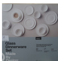
18 pc Glass Dinnerware Set