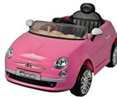
Fiat 500 -pink or blue $136.00 / $185