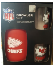
Chiefs Growler Set

We have been busy purchasing for the Christmas Extravaganza Sale November 17, 9:00 a.m. - 4:00 p.m. Each month we will share a little of the wonderful purchases we have bought just for you. Be sure to check out our Facebook page every week for even more fantastic items to come.