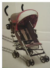
Scout A1 Sport Stroller