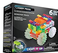
Laser Pegs Building sets