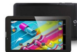
7', 9' & 10' Tablets