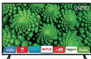
39" - 50" TV'S

Old Navy, Cracker Barrel, Applebee's, Chili's, Old Chicago, Darden, Outback, Red Robin, Red Lobster, PF Chang's, Texas Roadhouse, Rib Crib, Jose Pepper, Carlos O'Kelly's, Cabela's., IHOP, Dickey's, Regal. While supplies last.