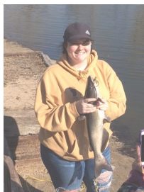
Lydia 3-6-21 4 lb. catfish

Notice: Please fill out this form to make sure we have your current information to guarantee your membership cards reaches you at your company mail code. Please send in home address changes to SBEA at K 30-35.