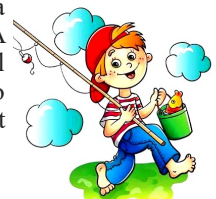
KID'S FISHING DAY

Bring the kids to come out and enjoy the lake and the thrill of catching a fish. We will stock the kid's pond with fish especially for this day. Prizes will be given away that day for the kids. Free hotdog, chips and pop will be provided for participating kids. Concessions will also be available. This is a chance to see what a great facility you have at SBEA. The SBEA lake is located at 4226 S. Gold. Members can save 10% off all kids fishing items after the fishing event. This is a great time to check out our tangle free kid's fishing rods. Meet in front of bait store at 9:00 a.m.