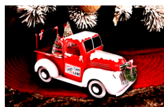
Christmas Vintage Truck

We have been busy purchasing for the Christmas Extravaganza Sale on November 23, 9:00 a.m. - 4:00 p.m. Each month from our September newsletter to our November newsletter we will share a little of the wonderful purchases we have bought just for you. Here's a little hint... Be sure to check out our Facebook page for more fantastic items that will be at the sale.