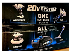
Hart All-In-1 tools