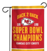
Back 2 Back Garden Flag